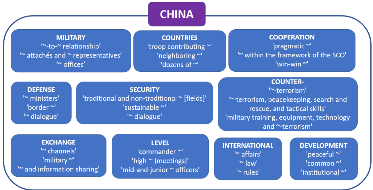
Figure 4. Lexical semantic patterns of terminology in the China Defense White Paper